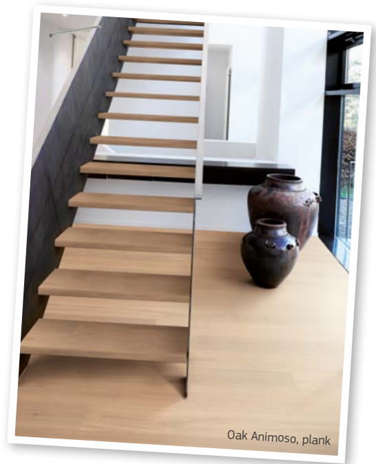
Oak Animoso, plank

The perfect floor is an integral part of a home, and almost a piece of furniture in itself, it becomes a frame for your life and your personal taste; beautiful to look at, naturally warm and strong enough to resist the challenges of daily use. A floor with the Live Pure surface is such a floor.